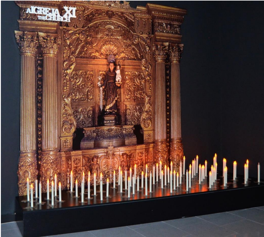
» Allusion to the Chapel of St. Anthony of the Church of São Roque (Lisbon). Lisboa Story Centre: The church (chapter XI, main floor).